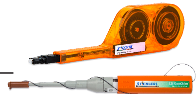
Sticklers™ 1.25mm & MPO CleanClicker™ Cleaners