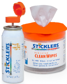
Sticklers™ Fiber Optic Splice & Connector Cleaner Fluid and CleanWipes™ Optical Grade Wipes