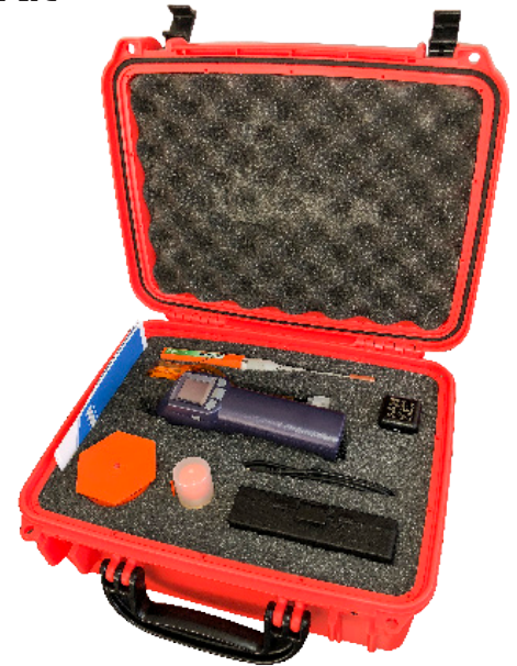
Kit contains everything you need for quick and effective fiber optic cleaning and inspection.

When you need perfectly clean splices & connectors™