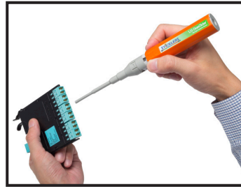
Step 2: Clean the connector end faces to remove the contamination