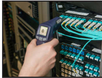
Step 1: Visually inspect the connector end face