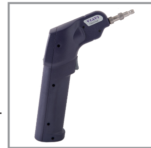
VIAVI FiberChek™ Probe Microscope with Automated Inspection Software